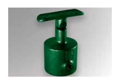
In-Line Top Rail 555-8